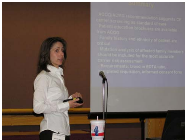
Speakers for both technical and managerial topics