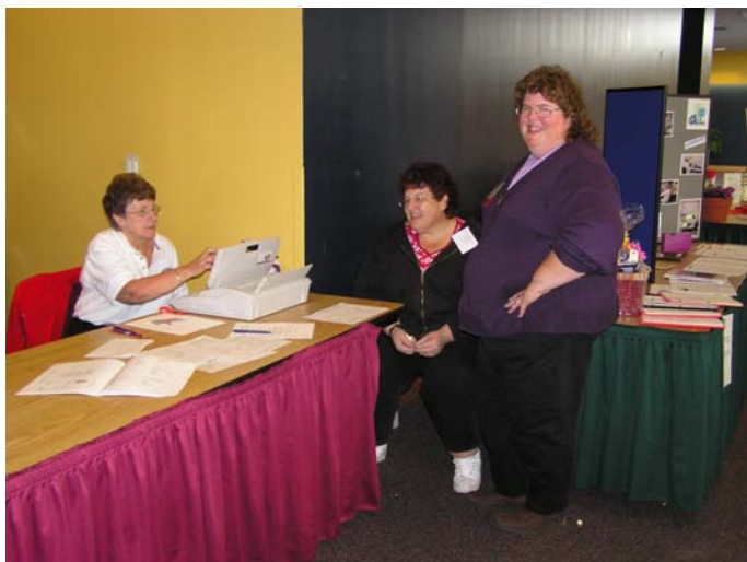
We had help with registration from the Dayton Convention & Visitors Bureau

The 2004 Ohio River Valley Conference was held April 27-April 29 in Dayton. “The Art of Healthcare – The Lab Mosaic” included a Tuesday evening wine & cheese reception and the Pre-conference workshop. Over 100 registrants attended the Wednesday and Thursday sessions with a great selection of speakers and vendor exhibits. Sixty-five attendees enjoyed the Networking scavenger hunt, planetarium and Italian buffet at the Boonshoft Museum of Discovery.