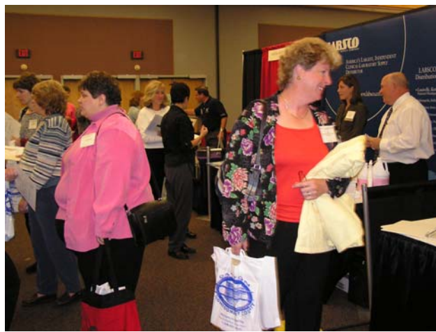
Vendor time to gather information, goodies & door prizes