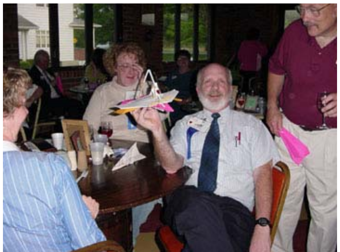
Our theme "Soaring into the Future" was the inspiration for the networking dinner activity!