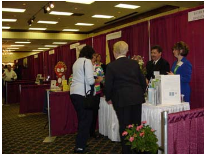
Vendors provided information and prizes!