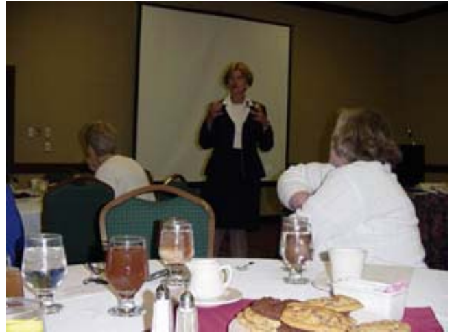
Speakers on both management and technical subjects