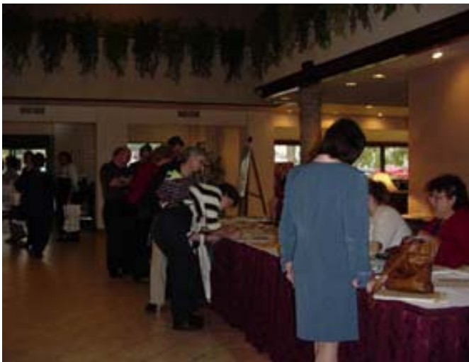
Registration started early!