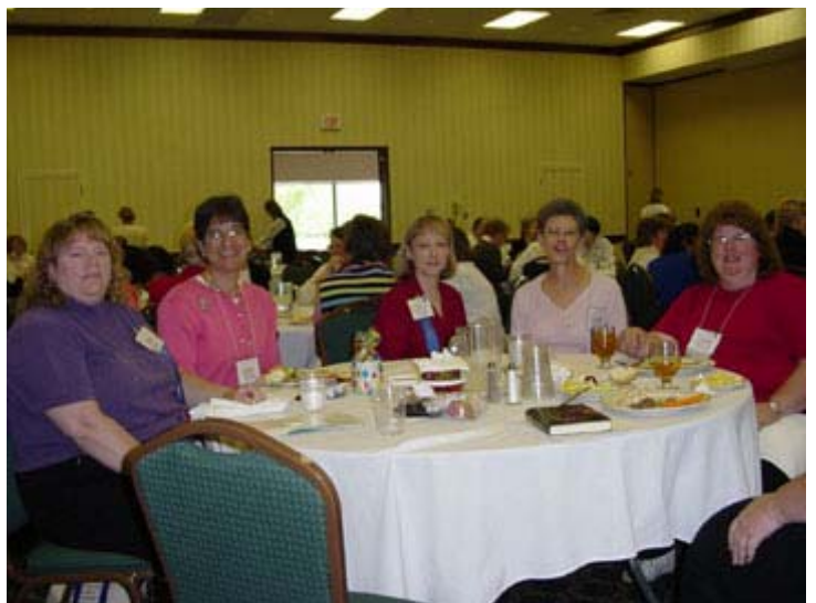
Luncheon activities included speakers